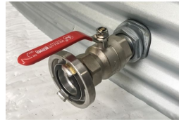
50mm Outlet with Storz Fitting