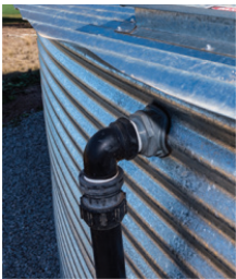
50mm Inlet for Steel Liner Tank