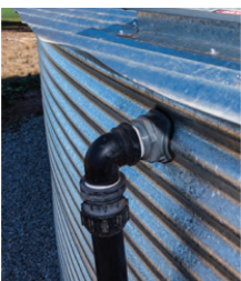
50mm Inlet for Steel Liner Tank