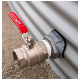
50mm Outlet and Ballvalve for Steel Liner Tank