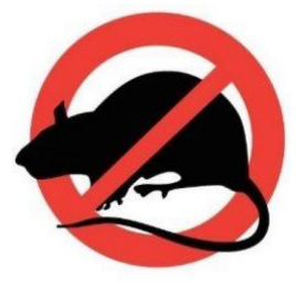
Vermin Proofing for Steel Liner Tank