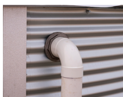
100mm Overflow for Steel Liner Tank