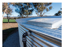
Lockable Steel Manway for Steel Liner Tank