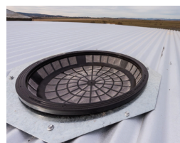
500mm Leaf Sieve for Steel Liner Tank