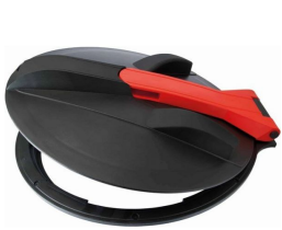
455mm Screw Access Lid