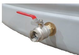
50mm Outlet and Ball Valve