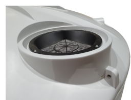
500mm Leaf Sieve